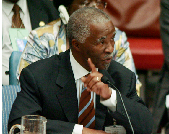
South African President Thabo Mbeki, Chairman of the Southern African Development Community.

A FTA is defined primarily by the lack of trade barriers such as tariffs and quotas on goods traded between member nations. The establishment of continued on page 7