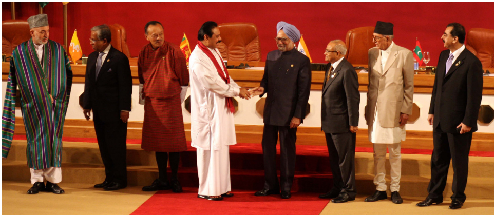
Sri Lankan President Mahinda Rajapaksa, Chairman of the 15th SAARC Summit, (4th from Left) welcomes (Left to Right) Afghan President Hamid Karzai, Bangladeshi Chief Adviser of Government Fakhruddin Ahmed, Bhutanese Prime Minister Lyonchhen Jigmi Y. Thinley, Indian Prime Minister Manmohan Singh, Maldivian President Maumoon Abdul Gayoom, Nepali Prime Minister Girija Prasad Koirala and Pakistani Prime Minister Yousuf Raza Gilani.

The South Asian Association for Regional Cooperation (SAARC), described as one of the world's biggest regional organisations, has strongly reaffirmed its political commitment to accelerate economic growth, social progress and cultural development among its eight member states. The leaders of Afghanistan, Bangladesh, Bhutan, India, Maldives, Nepal, Pakistan and Sri Lanka agreed to strengthen