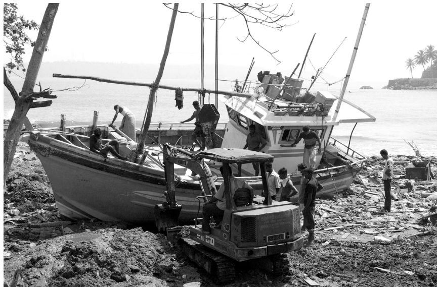
A view of the destruction caused by the tsunami of 26 Dec. 2004 in Galle, a town in southern Sri Lanka, where relief workers and volunteers found 7,275 bodies while clearing up debris.

Asian cities from climate change stem from how exposed they are to the ravages of nature as the planet gets hotter, states the Bank, since this region has more than 30 mega cities, with populations over five million, that are in coastal areas. They include Jakarta, Bangkok, Ho Chi Minh City and Manila. According to the Bank, China leads the East Asian countries with coastal populations "most highly vulnerable to sea-level rise." The regional giant has close to 80 million people who stand exposed, followed by Japan, with some 30 million; Indonesia, with 25 million; Vietnam, with 13 million; Thailand, with 13 million; the Philippines, with seven million; and Burma, with three million.