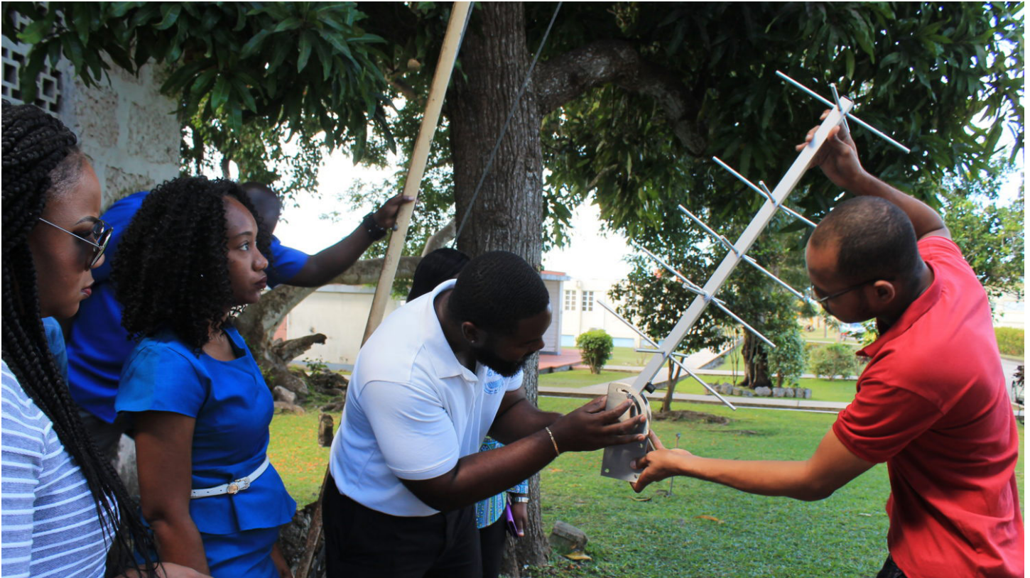
Meteorologists and hydro-met technicians assemble one of the 40 Automatic Weather Stations being installed by the Caribbean Community Climate Change Centre with funding from the USAID Climate Change Adaptation Program