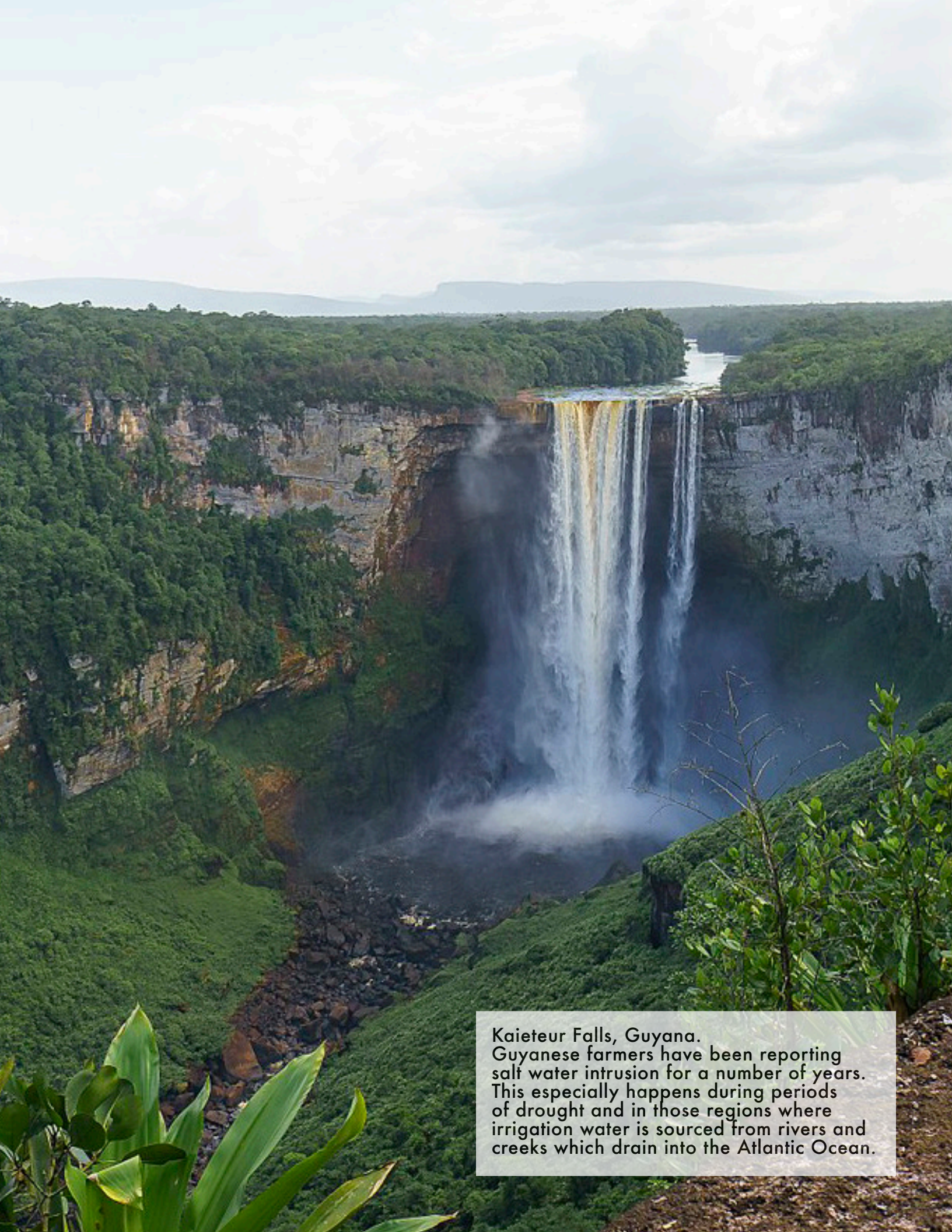
Kaieteur Falls, Guyana. Guyanese farmers have been reporting salt water intrusion for a number of years. This especially happens during periods of drought and in those regions where irrigation water is sourced from rivers and creeks which drain into the Atlantic Ocean.